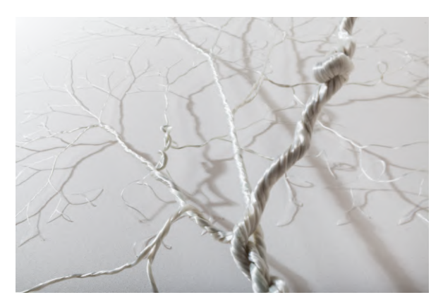
Janaina Mello Landini, Ciclotrama 37 (Aglomeracão), 2016. (detail) 48 mm diameter white nylon rope embroidered on linen canvas, 80 x 120 cm x 3

"And first the fourfold root of all things hear! White gleaming Zeus, life-bringing Hera, Aidoneus and Nestis whose tears bedew mortality"